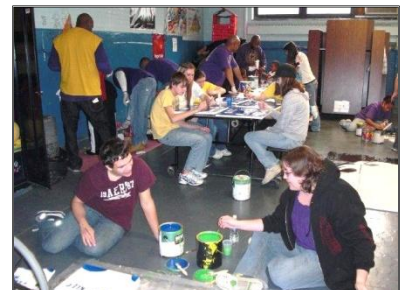
Dr. Martin Luther King Jr. Day of Service at PS #38 in Jersey City, New Jersey

Global Youth Service Day – This is a national day of service that Pass It Along participates in each year. Each year the projects vary in location and actual project. However, it is typically an all day event served by teen volunteers. In 2010 our teens did a painting project at a YMCA in West Orange.