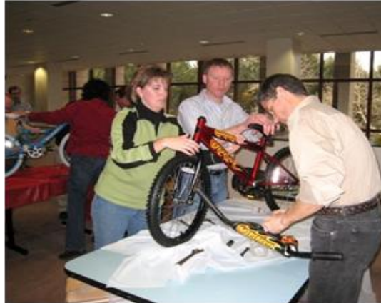
Selective Insurance Build a Bike Program