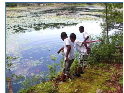
Tilly's Kids Summer Day Camp Nature Program

Pass It Along's mission is to awaken, validate and nourish the innate desire to 'give back' by mobilizing youth as community partners.