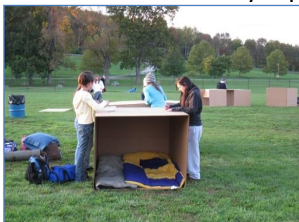
Youth Preparing their Box to Sleep in at Box City