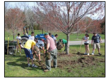
Alternative Spring Break at Swartswood State Park in New Jersey

Serve-A-Thon - This annual event brings together hundreds of people within our community for day of service to make a difference in their neighborhoods. Each year our Serve-A-Thon grows in the magnitude of the projects offered for the day. In addition to signature projects, smaller projects are conducted to assist senior citizens as well.