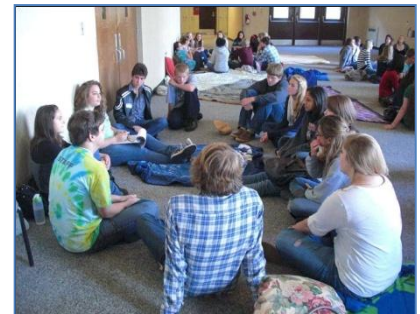
Small Group Sessions at Youth Conference