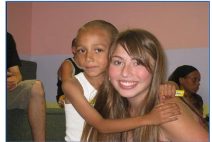
You've Got A Friend Mentoring