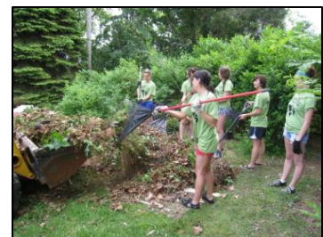
Volunteers at Camp Nejeda in Stillwater, New Jersey and Post House in Chester, New Jersey

Pass It Along’s mission is to awaken, validate and nourish the innate desire to ‘give back’ by mobilizing youth as community partners.