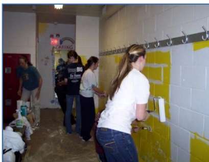
Global Youth Service Day Mural Painting at a Day Care Center