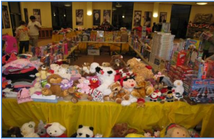
Toys collected for the Toy Shop

Below are additional images from some of our programs: