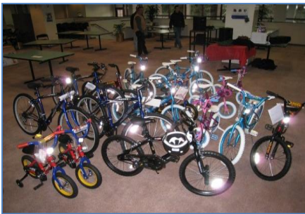
Bikes Collected and Assembled by Selective Insurance for the Toy Shop