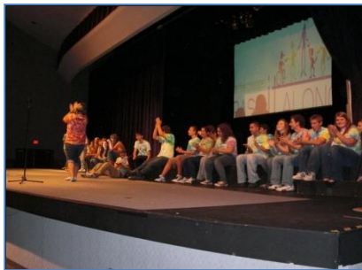
Youth Leaders on Stage at Youth Conference