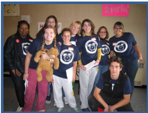
Youth Conference 2009